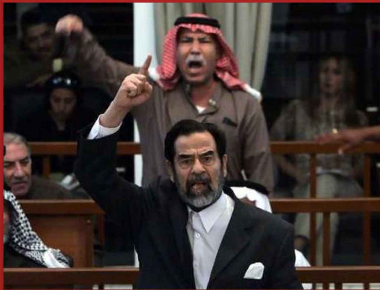
SADDAM HUSSEIN Used to be Iraq Star