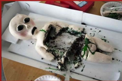
THE ALIEN AUTOPSY Went Terribly Wrong