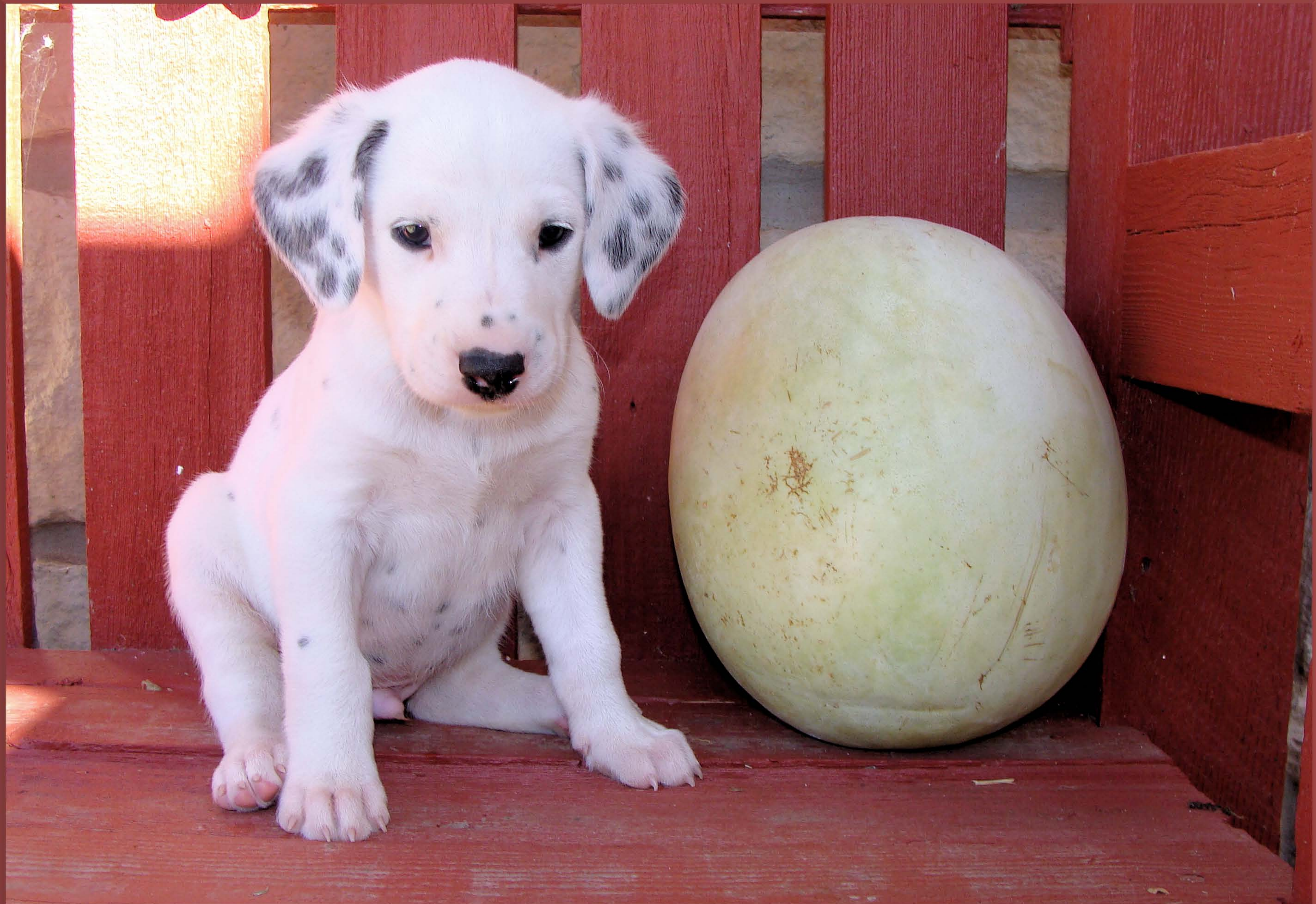
A RARE BREED OF CENTRAL TEXAS DALMATION Is Hatched From Eggs