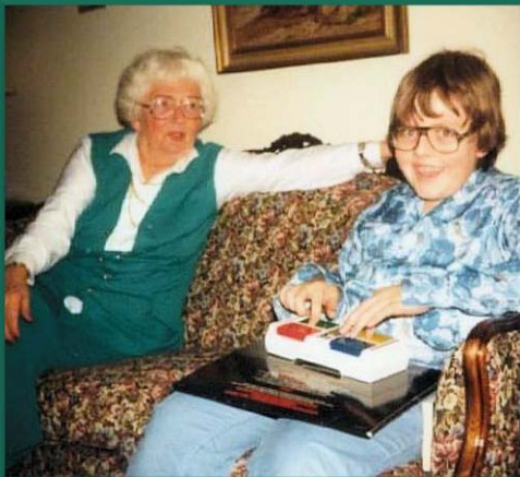
BLANCH CAN CONTROL ART'S MOTOR FUNCTIONS Using Subtle Cochlea Manipulation