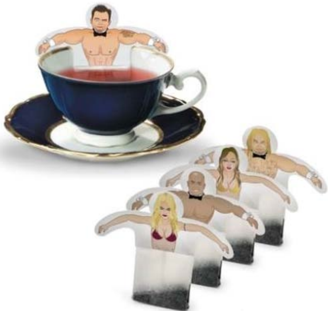
THE "WON'T YOU JOIN ME IN A CUP OF TEA?" Collection of Teabags