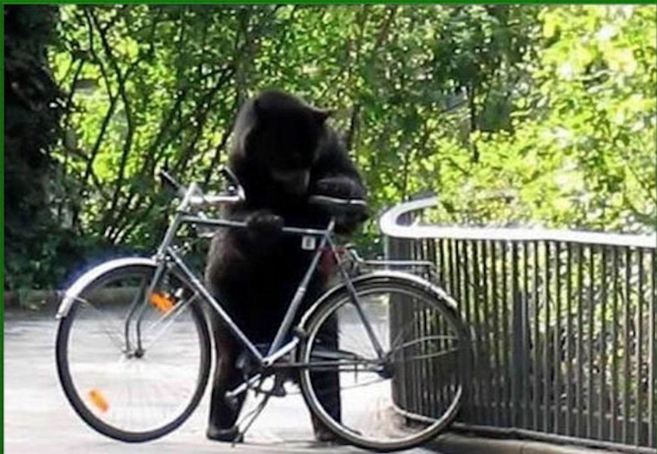
BEAR BIKE RIDER