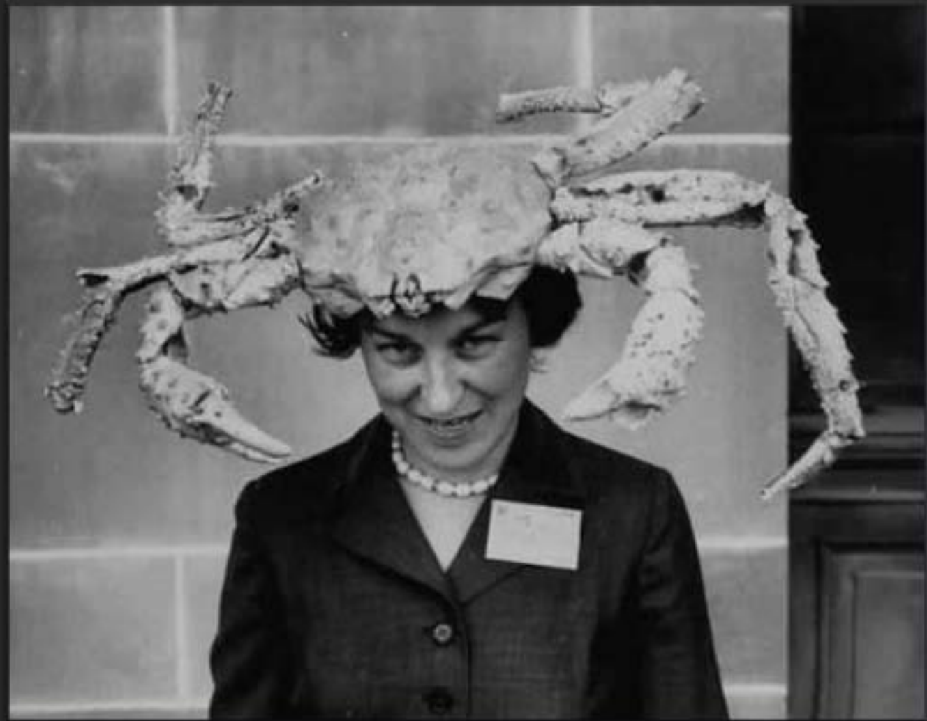
MISS CRABTREE SEDUCTIVELY APPROACHED MR. BUTTERMAN.