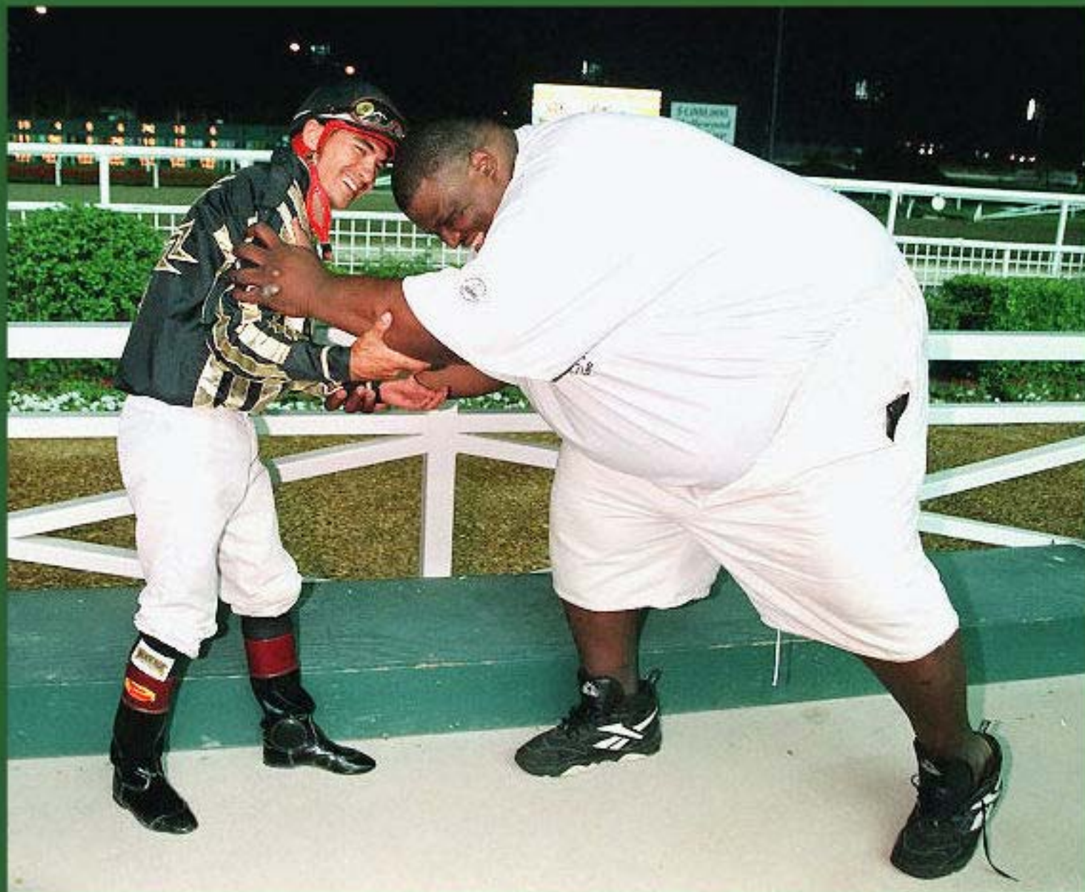
LITTLE JIMMY DAKOTA HAD A SECOND JOB As A Life Guard In Big Benny's Cereal Bowl