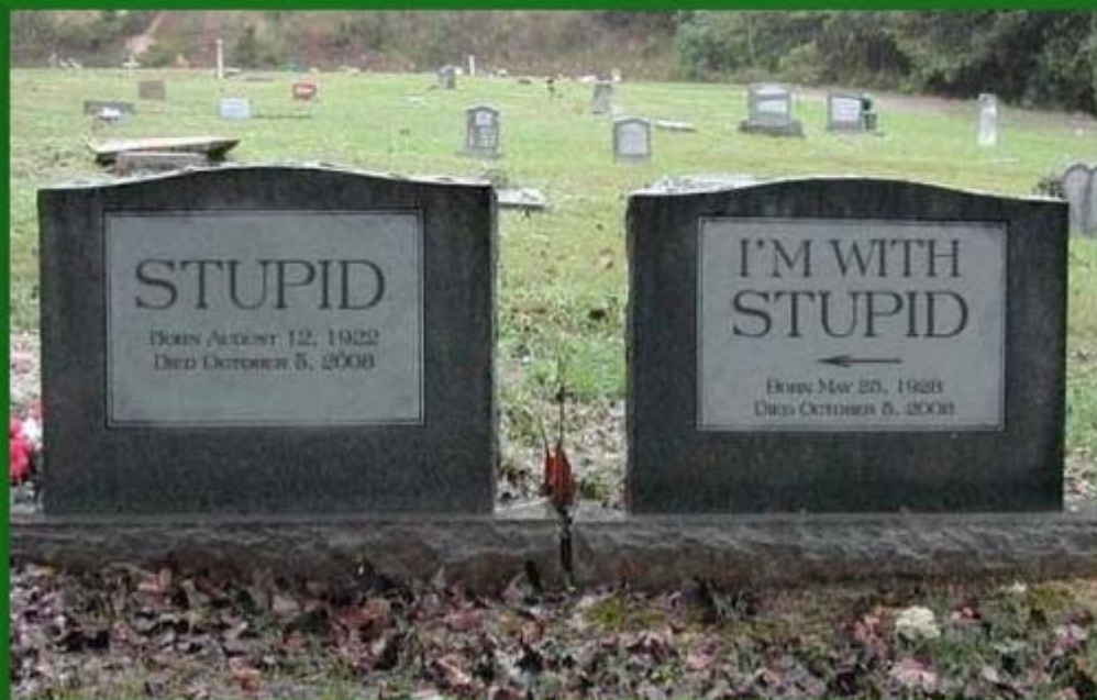
TOM AND ANGNUS BRIGHTON Took Their Constant Bickering to The Grave